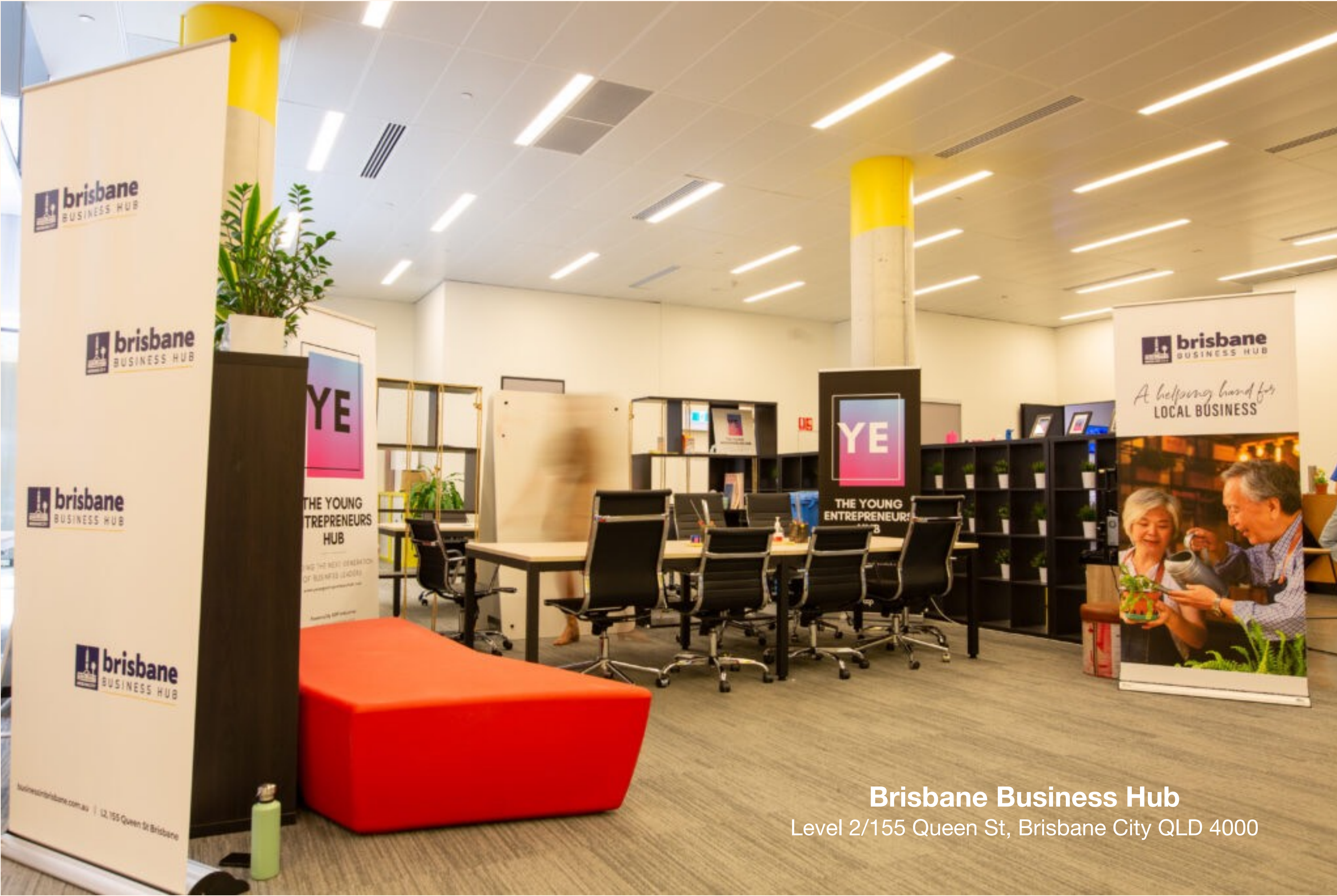
Brisbane Business Hub Level 2/155 Queen St, Brisbane City QLD 4000

Design by Jackson Hsu