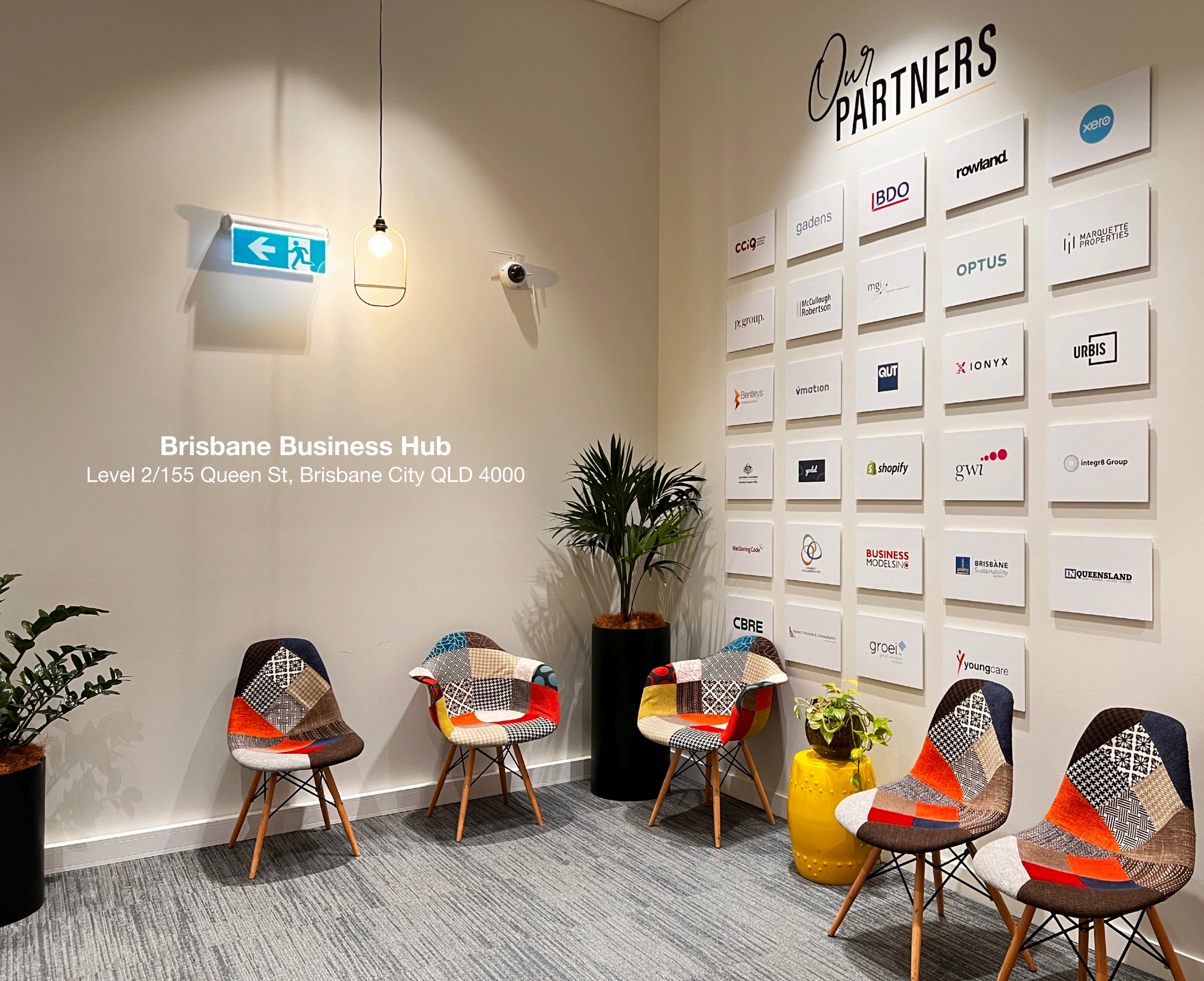
Brisbane Business Hub Level 2/155 Queen St, Brisbane City QLD 4000